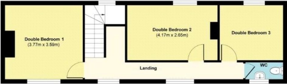
First Floor Approximate Floor Area (47.47 sq. m)